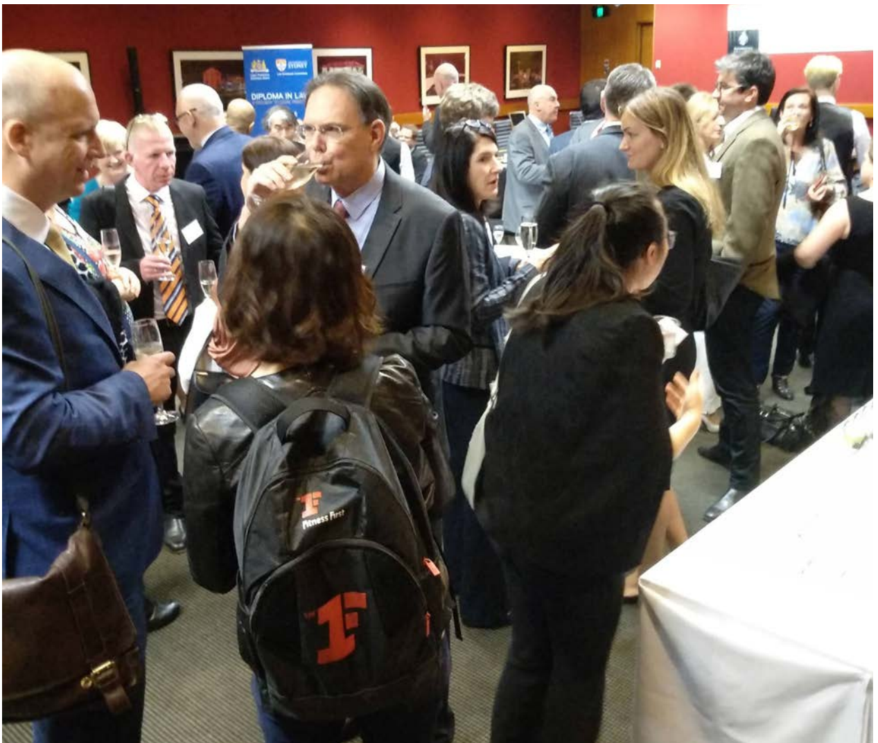
2018 Alumni function at NSW Parliament House.

https://www.linkedin.com/school/lpab-lec-diploma-in-law/